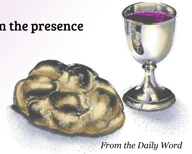
From the Daily Word